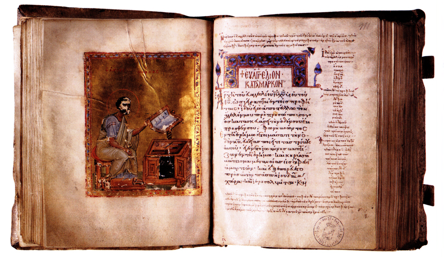
4. Janus Pannonius' Book of Gospels in Greek, 10th-11th century, Budapest, ELTE Egyetemi Könyvtár (Cat. 12.7)

could have acted as a bridge between the reunited eastern and western branches of Christendom, the dream of Bessarion, which came to pass in Florence. That the union came about was mostly due to Cardinal Bessarion, who until the end of his life (1472) struggled for its actual implementation and survival.