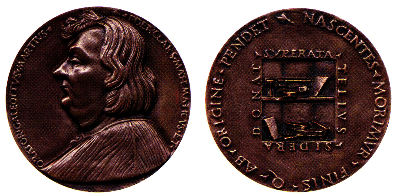
3. Medal of Galeotto Marzio, second half of 15th century, Budapest, Magyar Nemzeti Múzeum (Cat. 12.2)